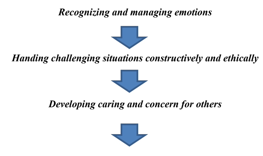
Making responsible Establishing positive decisions relationships

Schools are expected to take a proactive role in nurturing students' pro-social behavior. Social-emotional learning must be a basic component of a school's program of universal prevention for all students. Effective social-emotional learning helps students develop fundamental life skills, including: